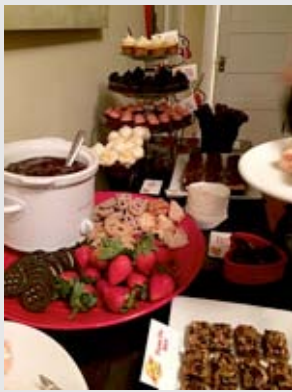
Valentine's Party - GF Dessert Bar