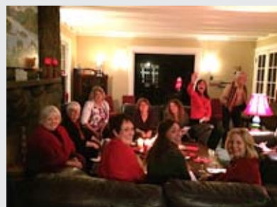
Playing the "Oldy-Wed" Game - guys are downstairs!