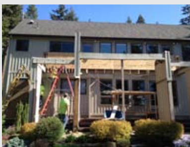
Guys helping demo a deck!

We are grateful for the work - sorry for the long wait!