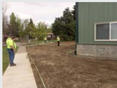
Cleaning up & reseeding Fish Food Bank

Thanks so much for these big projects and all of you having us help