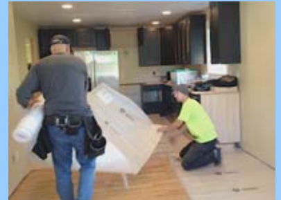
Max & Connor getting the flooring ready!

What a wild ride! As you may remember WINGS assumed the loan of a house at 1265 Methodist, which we are in the process of remodeling to put up for sale next month! We have had wonderful contractors who have not only given us very fair pricing on their services, but have worked along-side and trained our young men in their area of expertise.