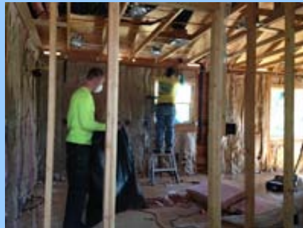
Cody finishing the insulation!

What a wild ride! As you may remember WINGS assumed the loan of a house at 1265 Methodist, which we are in the process of remodeling to put up for sale next month! We have had wonderful contractors who have not only given us very fair pricing on their services, but have worked along-side and trained our young men in their area of expertise.