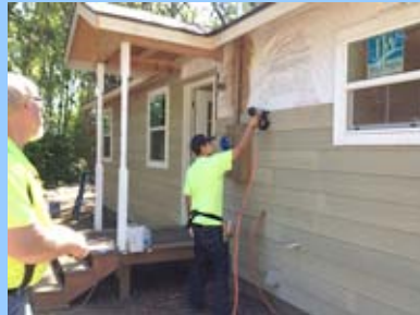
Chicoby getting the siding done!