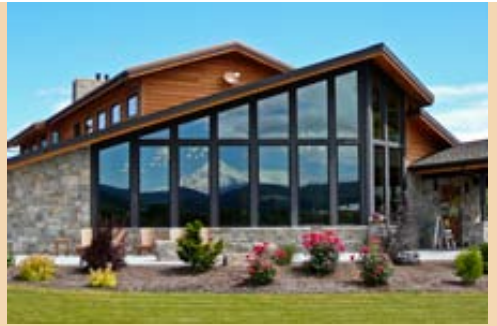
Tasting Room at Mt. Hood Winery