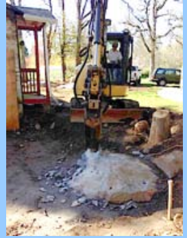
The Big Bopper!

Of course - it is the Rockford area of Hood River, so before we could start digging out our foundation - we had to unearth a couple of boulders - geez! And what did we discover - a Volkswagen bug sized boulder! So - had to bring in the BIG rock crusher!!