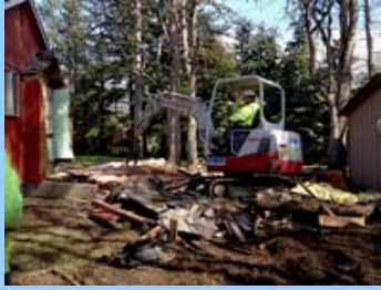
Walt, you are amazing!